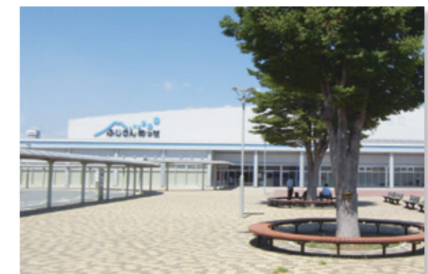
Meeting place "Fujisanmesse"

Regarding exports of used paper cartons, some said a large volume of them were being exported, while others said export volumes of used paper cartons were not able to be identified because they were mixed with other miscellaneous recyclable papers. They gave the principles of the market economy as the reason. Namely, the price of home-use papers in the export destination is generally higher than in it is Japan, as is the price of used paper cartons.