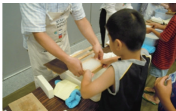
Making postcards from handmade paper!