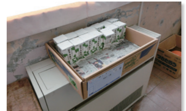
They are drying milk cartons after rinsing.

Some of the Grade 3 to 6 students at this school are practicing milk carton recycling activities triggered by the paper carton collection boxes that were installed by a dedicated environmental protectionist about four years ago. Before school meal is served, children other than those who have been tasked with serving school meals cut open the milk cartons that were washed yesterday and dried up to the current day, and put them into the collection box. After lunch, children rinsed milk cartons with water and put them in an empty turning them upside down to dry. (Ninety one fourth graders attended the lesson)