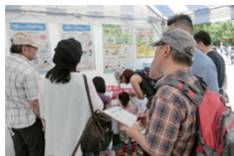
Challenging quizzes about paper cartons