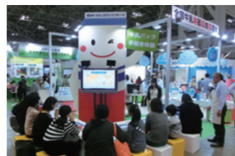
At the workshop