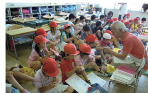
Children are peeling off polyethylene film.

We told children to peel off polyethylene film from milk cartons. Then cartons were then torn to pieces and put into a blender. After blending, we show them white pulp fibers of the cartons to let them know why milk cartons must be separately put out. (140 children from all grades attended the lesson.)