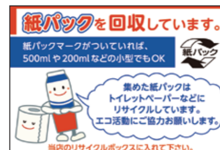
POP card created for in-store use

We have created educational POP cards for paper carton recycling and, with cooperation of large supermarket chains Uny Co., Ltd. and MaxValu Chubu Co., Ltd., displayed them on store shelves. These cards tell consumers in an easy-to-understand way using "Milk Packn" that small (500 and 200 ml) containers can be recycled if they carry the "paper packages" marking, and that collected milk cartons are recycled into various product such as toilet rolls. Then the design was revised to attract more attention to the store, and posted on store shelves in Uny Co., Ltd. to educate consumers.