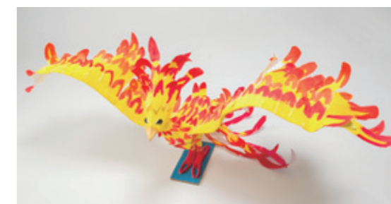
Grand Prize creation "Milk Phoenix" Yuri Takada