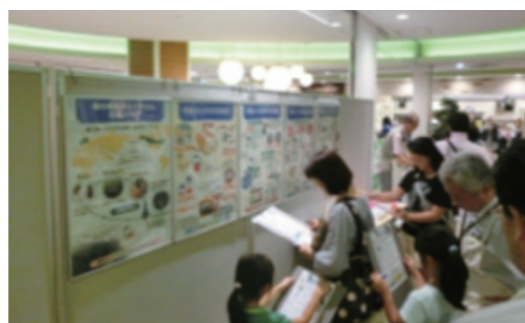
Visitors learned the flow of paper carton recycling

The campaign presented a variety of events for visitors including exchanging six paper cartons with a box of tissue paper made from recycled paper cartons, the experience of making paper by hand, quizzes, and an introduction to the recycling through the use of samples of products made out of recycled paper cartons.