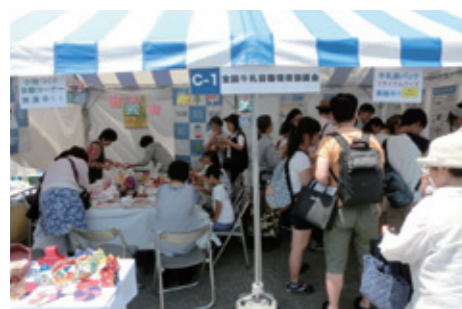
Creation of accessory pouches was popular among visitors