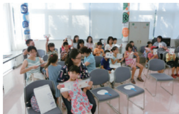
Beautiful postcards are made from handmade paper.

[Shimizucho, Shizuoka Prefecture] August 4