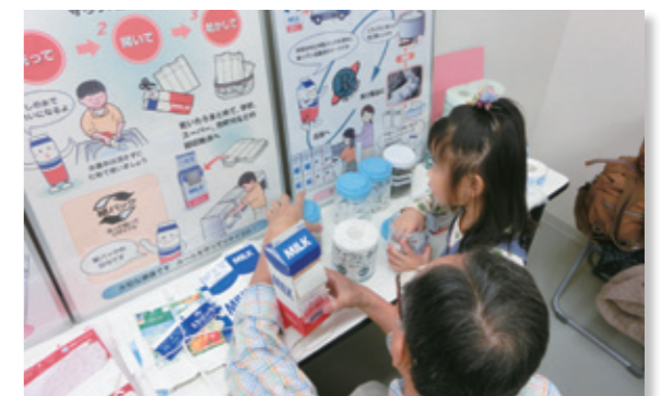
Study on recycling with the panel.

We have supported the second "Recycling Thanksgiving" held by Osaki West City Tower Management Association and Residents' Association with an educational campaign on milk carton recycling. We were able to interact with residents through various events such as exchanging their used milk cartons with toilet rolls, quizzes, survey interviews, making postcards from handmade paper, and a recycling workshop.