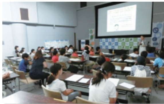
Eagerly listening to the lecture.