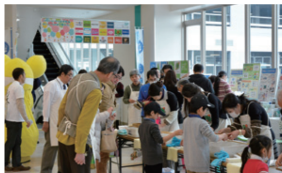
Paper making corner crowded with visitors

On March 7, as part of "Operation Sagamihara Trash DE71", we held a workshop titled "Let's create greeting cards with milk cartons!" at Nitori Mall Sagamihara mass merchandise store. We believe about 300 participants including those who only took part in a quiz realized that paper cartons are excellent resources.