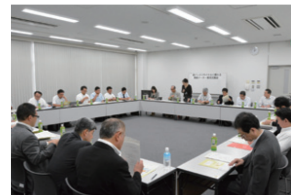
A discussion meeting.

Recycled paper manufacturers reported that shipments of paper cartons to them are falling. They pointed out two causes: One was the decrease in use of paper-carton drinks and the other was increase in export of used paper cartons.