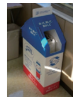
"Paper carton collection box" installed

We are promoting use of half size paper carton collection boxes that can be installed in areas with limited space. Thanks to advice received from Tama City, this type of box are installed at many convenience stores in the city to promote paper carton collection.