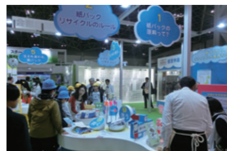
Explanation by use of environmental panel table