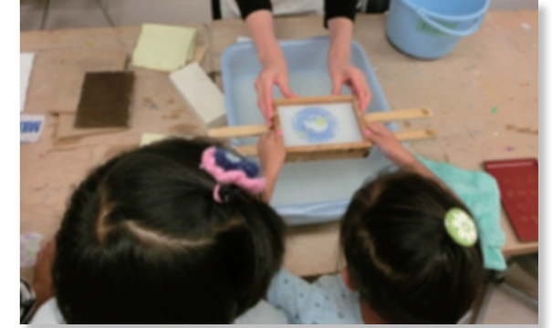
An original postcard made from handmade paper.

In the parent-child workshop held at Atsugi Citizens' Exchange Plaza Atelier, a multi-purpose exchange facility, used milk cartons brought by participants were exchanged with toilet rolls. They seemed to have fun as shown by the various questions asked in the run-through of paper carton recycling, which was demonstrated using recycled exhibits. It will likely become a lasting memory of their summer vacation along with the postcards made from handmade paper.