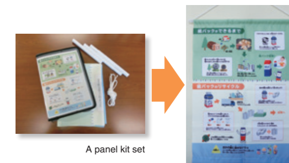
A panel kit set