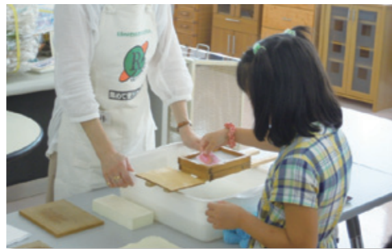
She is very gently placing a picture while holding her breath.