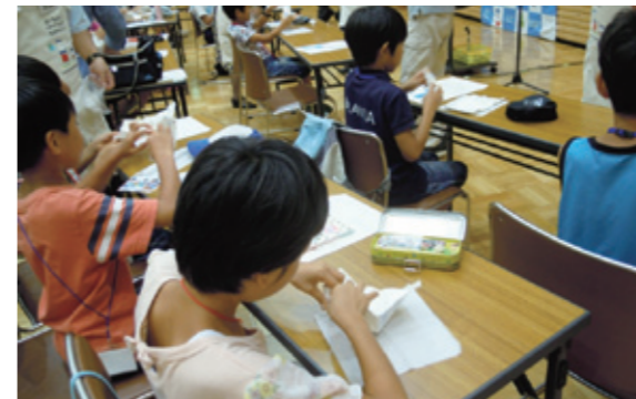
You can open milk cartons cleanly and quickly by hand.

Our recycling workshop, which was held as part of the events hosted by Shimizucho Regional Exchange Center, was attended by 33 elementary school children in grades 3 to 6. These children from Shimizucho elementary school skillfully disassembled milk cartons by hand because they do this every day after school meals. The COMCEI staff held a study session in the student's free time so that they could learn more about paper cartons and the raw materials that made up a cartons in front of them.