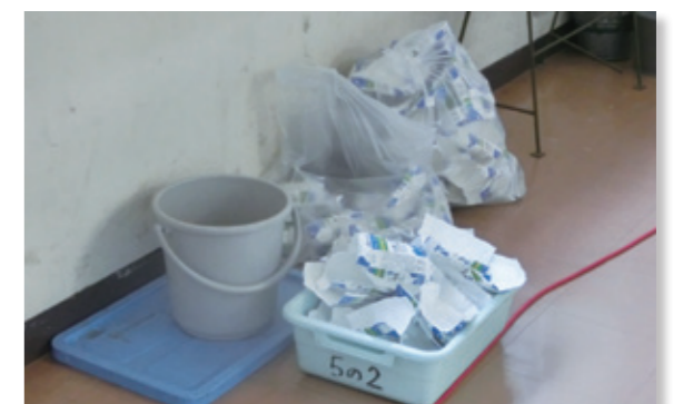
Collection boxes full to the brim with milk cartons.

After drinking milk that was part of their school meals, all children at this school routinely wash, open and dry the milk cartons. A collection box installed in front of each teaching room was full to the brim with milk cartons. They were surprised to learn from the lecture how carton collection methods differ between Japan and overseas countries. They realized the importance of the recycling activities they carry out. (Forty six fourth graders attended the lesson)