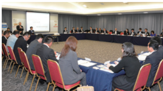
Regional conference in Kitakyushu

utilize "Eco-per" and difficulties of the base and group collections.