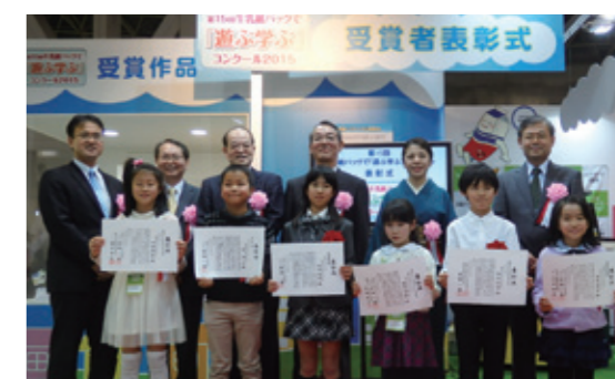
Awards ceremony held at "Eco-Products 2015" at the COMCEI booth