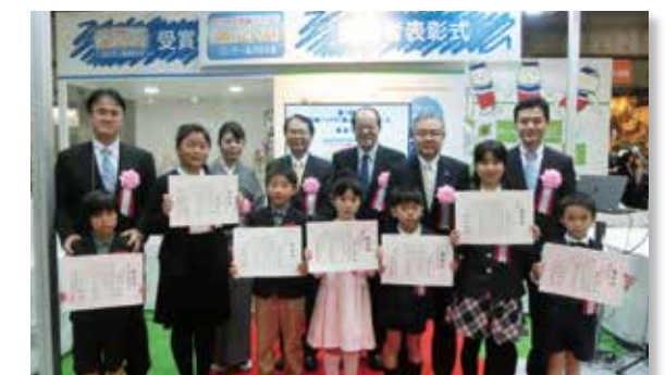
Awards ceremony held at "Eco-Products 2016" at the COMCEI booth