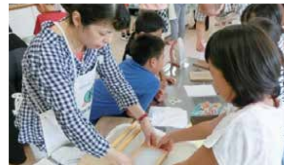
Making postcards from handmade paper

Onsite lesson at Shiranehyakuta Elementary School, facing Mt. Fuji and Mt. Yatsugatake, in a quiet environment rich with nature. Children were surprised to learn that Yamanashi Prefecture is the birthplace of milk carton recycling. While making postcards from handmade paper, they were amazed at the whiteness of pulp made from milk cartons. While learning about the importance of recycling, students mentioned that they should "rinse, open and dry" milk cartons at home like they do at school after lunch (Sixty fourth graders attended the lesson).