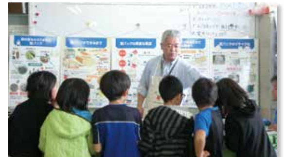
COMCEI staff answering children's questions

Aiming to create environmentally friendly schools, Saga City established a school-type Environment ISO system. All the elementary schools and junior high schools have been certified. Wakakusu Elementary School has been carrying out environmental education and group collection of garbage. However, in the past, milk cartons were occasionally mixed with waste papers. Taking this as a lesson learned, the right way to recycle milk cartons was conveyed, which made the lesson meaningful (Forty nine third graders attended the lesson).