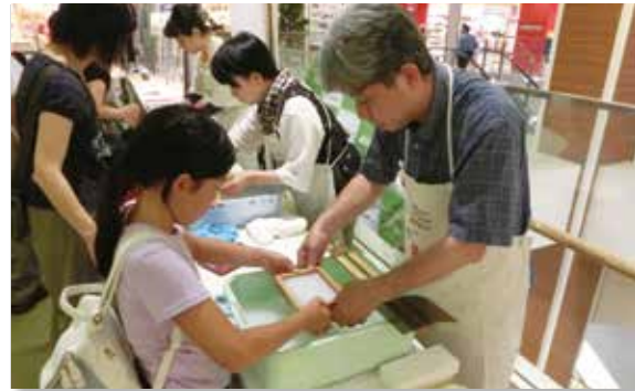
Making postcards from handmade paper

We co-hosted the fourth "Milk Carton Recycling Promotion Campaign" hosted by LaLa garden Nagamachi for two days. This year, with the support of Sendai City, the collaboration between waste-reduction campaign characters "Wakeru-kun family" and COMCEI's "Milk Packn" came true. We conveyed how wonderful raw material pulp for making paper cartons is, as well as the importance of recycling.