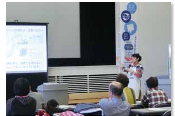
Lecture by Representative Hirai

Noda City hosts the "Noda City Recycle Fair" every year that features used book market, flea market, and other events. As part of the fair, a workshop was held in which a total of 19 people, consisting of 14 citizens and five civil servants, participated. Most of the participants were adults. Many of them took notes during the workshop, showing a high level of awareness regarding recycling. In a handmade paper-making activity, adult participants enjoyed the experience in a friendly atmosphere. All of them, including the civil servants, completed making original postcards from handmade paper.