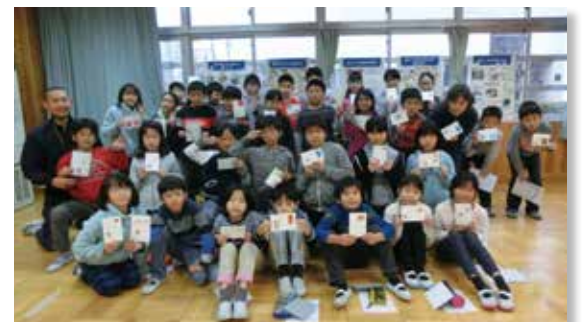
Taking a photograph with original postcards in their hands

There was snow in November for the first time in 54 years on this day. Cheerful, lively children who would not let the cold weather get them down, participated. Students had earlier found it difficult to make postcards from handmade paper in class, however, this time, they succeeded in making their own original postcards. They practice "Rinse, open and dry" of school milk cartons. The school has a high level of awareness of recycling (One hundred from three classes in fourth grade attended the lesson).