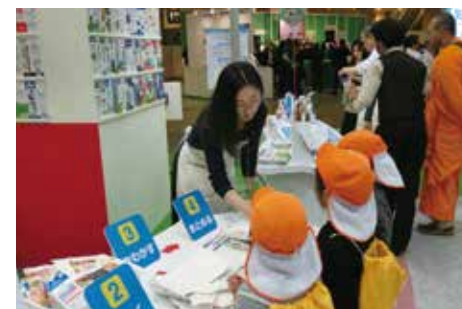
Explanation by use of environmental panel rally