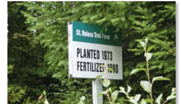
A sign in the forest indicating information such as the year it was planted

In Japan, garbage is separated into several types before collection. In America, garbage is collected and then separated. In this facility, garbage is separated into two types: (1) recycling paper (newspaper, packaging containers, books, packaging paper), (2) bottles, plastic, aluminum containers (paper containers were added last year). Resources collected from collection boxes in various areas of California are separated by a machine and then workers manually separate the resources. Landfills are the usual destination for garbage that cannot be recycled. Lots of time and effort goes into this work. We thought the Japanese method of separating before collection is more beneficial.