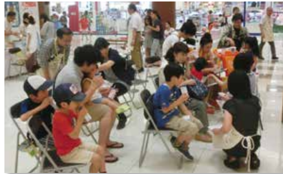
Disassembling milk cartons by hand

With the support of Kawaguchi City, we held a paper carton recycling campaign event titled "Let's experience recycling" at Ario Kawaguchi. We saw some elementary school children who visited the event teaching their parents how to disassemble a paper carton using methods they had learnt at school. We felt that this will lead to the spreading of knowledge about recycling.