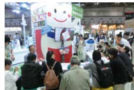
At the workshop