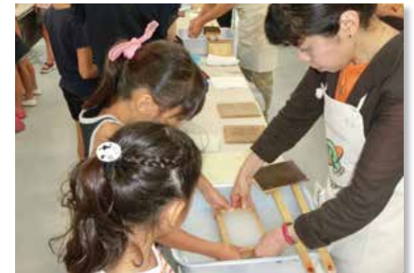
"Making an original postcard made from handmade paper"

Nishitokyo City planned a "Summer Vacation Research Project" event and held a workshop in cooperation with JAMRA. In extreme heat, 46 elementary school students and 20 parents participated. In the workshop, they learned about the recycling status of milk cartons in Japan through quizzes and other fun activities. In a postcard-making activity, they made original postcards using handmade paper and were amazed by the beauty of milk carton pulp, and managed to find ways to express their creativity.