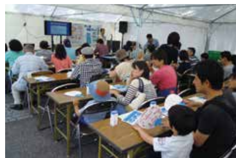
At the workshop