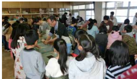
Enjoying making postcards

An onsite lesson held at Kaizuka City Chuo Elementary School attracted a large number of participants from four classes of fourth graders. Typical of Osaka residents, many of them were lively and friendly. They actively offered their thoughts and opinions during the presentation and the question-and-answer session, showing their positive attitude towards learning. In an activity involving making postcards from handmade paper, they created postcards featuring images and designs appropriate for the Christmas season (One hundred and fifty six fourth graders attended the lesson).