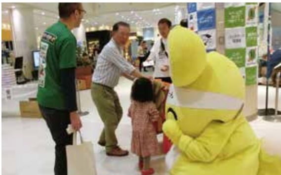
Sagami-hara City garbage collection squadron Shigenjya "Lemon Chan" spreading good cheer Making postcards from handmade paper

As part of "Operation Sagami-hara Trash DE71" hosted by Sagami-hara City, we co-hosted the Eco Workshop for the first time since 2013 at Ario Hashimoto. Despite the rain, many families visited during the morning. Sagami-hara City's Garbage collection mascot character squadron "Shigenjya Paper Pink" and "Lemon Chan" made an appearance and added to the fun to conclude the event with excitement.