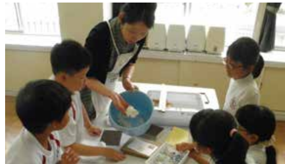
Explaining paper pulp to make postcards from handmade paper