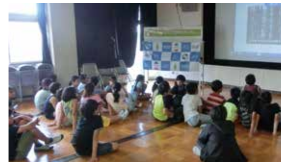
Learning about forestry management via DVD

Imai Elementary School had been teaching fourth graders about recycling for about a month. As part of this education, we ran an on-site lesson involving lectures and a postcard making activity. As their school lunch milk is filled in glass bottles, they couldn't "rinse, open and dry" at school, however, continued recycling-focused education will raise awareness of recycling at home (Seventy seven fourth graders attended the lesson).