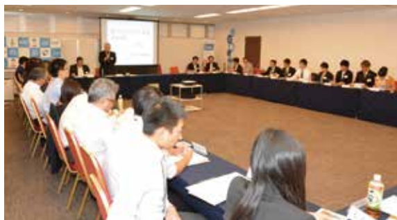
Regional conference in Aichi

goal. Subsequently, in fiscal 2015 garbage disposal volumes were reduced by approximately 40%, the volume of separately collected resources doubled, and the volume of garbage that ended up in landfills fell by approximately 80%, compared to fiscal 1998. It was also reported that the recycling rate of paper cartons, which was 28% in July 2000, increased to 48% in 2003.