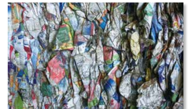
Paper cartons after being separated from other garbage