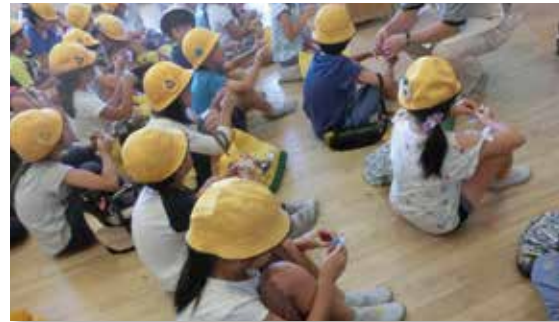
Experiencing peeling of polyethylene film

An eco Festival was held at Koshigaya City Obukurohigashi Elementary School that attracted 19 organizations and 16 groups of children. COMCEI and JAMRA worked with four groups. Children were very interested to peel off the polyethylene film from carton package and make postcards. In some of the classrooms, milk cartons used for school meals, which had been opened by hand were being dried, showed the high level of awareness regarding recycling (One hundred and forty seven children from all grades attended the lesson).