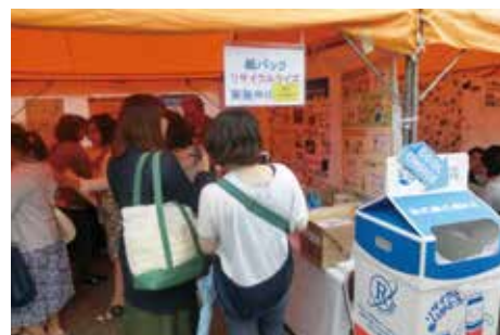
Inside the tent booth