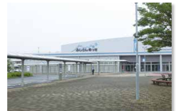
Meeting place Fujisanmesse