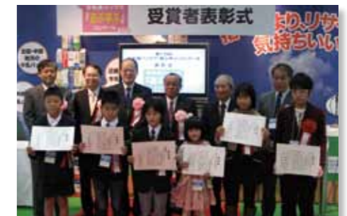
Awards ceremony held in Eco-Products 2012