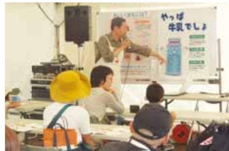
Dietary education and recycling information at workshop