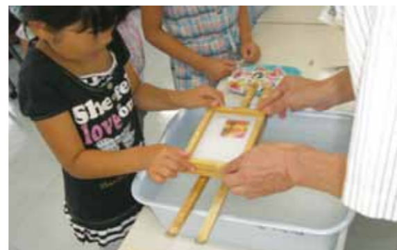
Trying hard to make postcards from handmade paper (Nishi Tokyo City)