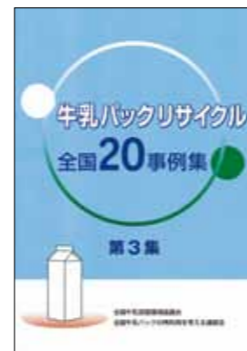
3rd volume "Nationwide Collection of 20 Cases"