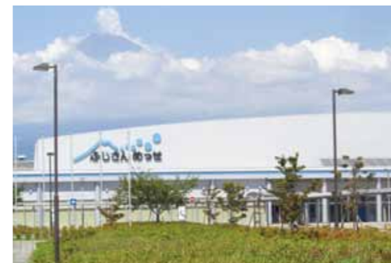
Meeting place "Fujisan Messe"