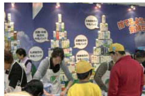
"Paper carton trees" donated by dairy product manufacturers across the country