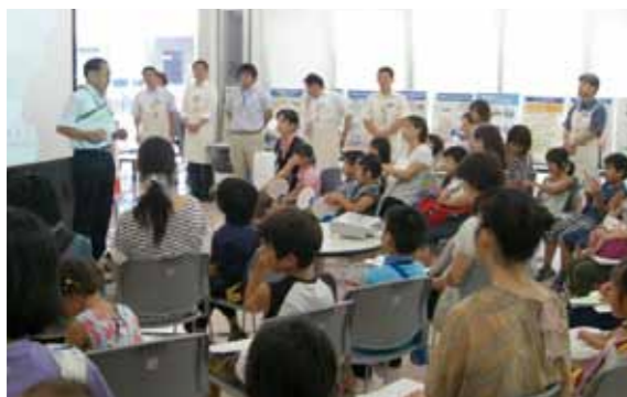
Speech of the Resource Recycling Section Chief of Sagamihara City (Sagamihara City)

Motegi Primary School is a historic school established in 1873. The building has warmth of the wood. The lesson was held in the gym for 40 first graders from two classes. They made original postcards from handmade paper. The children as well as their parents enjoyed the event. Recycling of milk cartons was not practiced at Motegi Primary School then but the school promised to look into the feasibility of recycling on this occasion. All staff members look forward to the outcome.