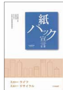
Book "Paper Carton Manifesto" Nihon Hyouron Sha

Currently, three methods have been established to collect paper cartons. These are: store collection, municipality collection, and voluntary group collection. To make strict separate collection a success, education of the local community and use of devices unique to individual communities are necessary. This case book introduces actual recycling activities carried out by citizen's groups, local governments and various business sectors throughout Japan to assist readers when they are confronted with problems.