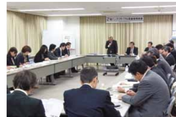
The Local Conference