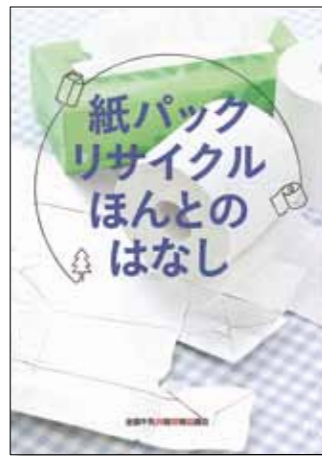
"Real Story of Paper Carton Recycling"

COMCEI published various publications to help people think of the global environment through recycling.