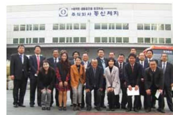
Staff members of the Korean secretariat and Japanese delegation