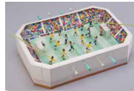
Best prize "Cheer up Japan! with Milk Cartons" Takeru Kuboya

Approximately 3,292 primary school children with and their works creations participated in the 12th "Learn and Play" with Milk Carton Contest 2012. Among the many impressive creations, the following seven prize-winning creations were selected through impartial examination. Congratulations.