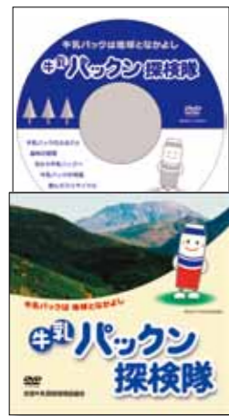
DVD "Milk Packn's Expedition"

This leaflet contains answers to the frequently asked questions we encounter in the course of promoting activities to improve the recycling rate of paper cartons. Using many illustrations it also clearly and simply explains that paper cartons are very environmentally-friendly products and they must be collected separately from other paper products to utilize this resource effectively.