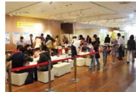
Workshop on "Making postcards from handmade paper" in Ginza Mitsukoshi

Transmission of latest information via WEB