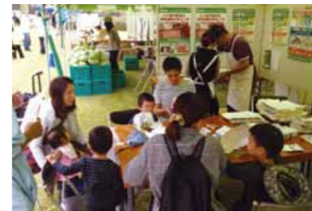
Booth of Kasumi in "Hinuma Environmental Festival"

COMCEI and JAMRA participated in the "Let's create original Christmas cards from milk cartons!" workshop in the Ginza Ecology Exhibition 2012 held in Ginza Mitsukoshi on November 17 and 18. The experience of making postcards from handmade paper was successful in making visitors feel the quality of recycled paper cartons.