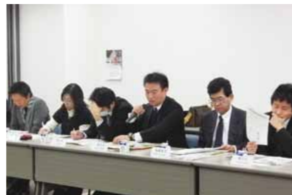
Meeting participants exchanging views