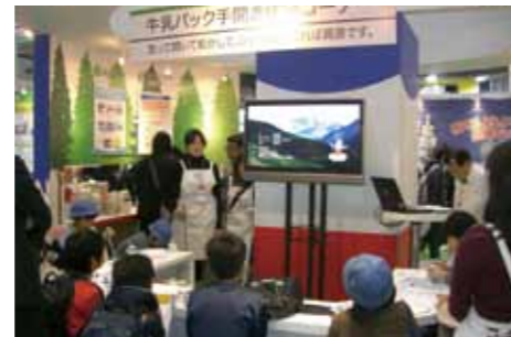
At the workshop