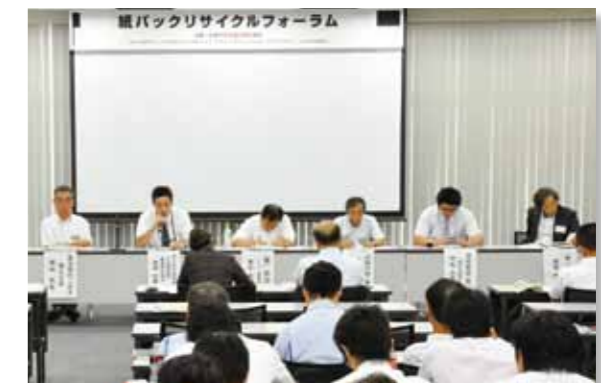
Panel discussion provided us with valuable opinions