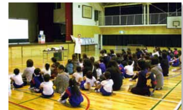
Onsite lessons (Motegi Cho Motegi Primary School)