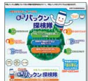
Website of Milk Packn's Expedition