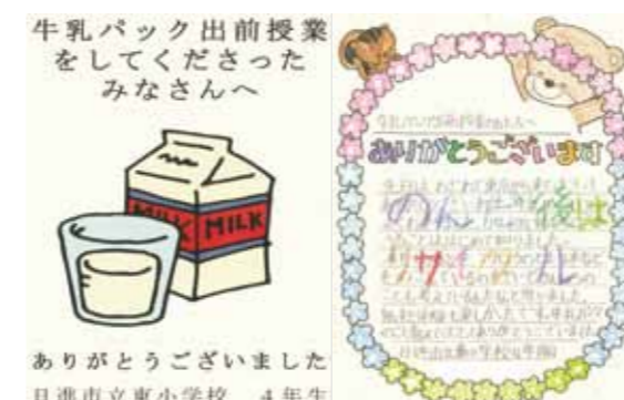
We received a letter of thanks for the onsite lessons (Nisshin City Higashi Primary School)