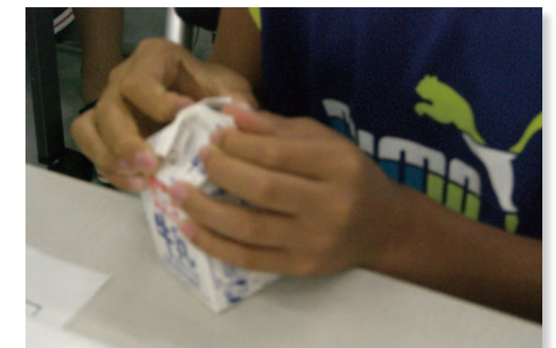
Workshop (Milk cartons are unpacked by hand.)

The destination of the onsite lesson, Kashimahigashi Primary School, was called off when we visited because of Typhoon No.24. At the discretion of the primary school, we therefore held the workshop for the teachers who were attending on the day and nurses of nearby nurseries hoping that it will be of some use for their environmental classes.