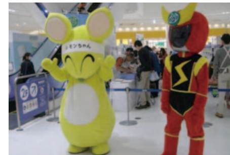
Trash separation characters of Sagamihara City "Lemon Chan and Shigenja"

[Collaboration with mass merchandise store "Ario Hashimoto"] On March 9, as part of "Operation Sagamihara Trash DE71", we held a workshop titled "Let's create greeting cards with milk cartons!" at a mass merchandise at Ario Hashimoto. More than 120 participants have created unique greeting cards. The most impressive of all was the card, which has been created by a group of junior high school students, with an illustration of a heart for White Day.