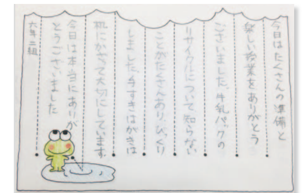
We received a letter of thanks for the onsite lessons (Hiroshima City Ushitashinmachi Primary School)

Matsusaki Primary School, which is located on a low hill near Takuma Station on the JR line, has a long tradition that began in the early Meiji era despite its modern school building being built of steel. The onsite lesson was attended by 29 fourth graders, two city workers, and Shikoku Meiji Dairies Corporation, which supplies milk for school lunches. The children, surrounded by many adults, took the class in a relaxed fashion.