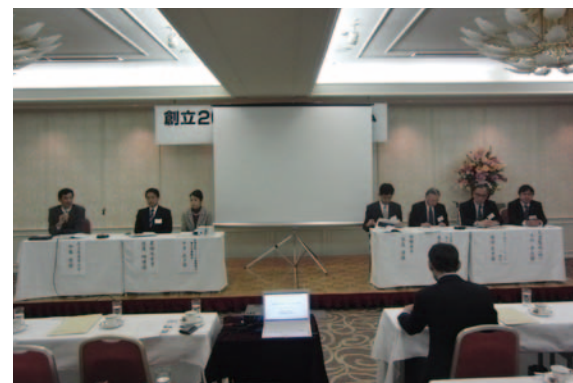
Attendants of panel discussion