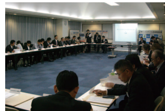
Regional conference in Osaka

local authorities' educational programs does not feature as highly as programs covering other containers (bottles, can and PET bottles). JAMRA also reported that it has expanded education activities related to recycling to shopping malls and supermarkets, too. In addition, according to their experience, demonstration of paper making is an effective means of communicating the importance of recycling.