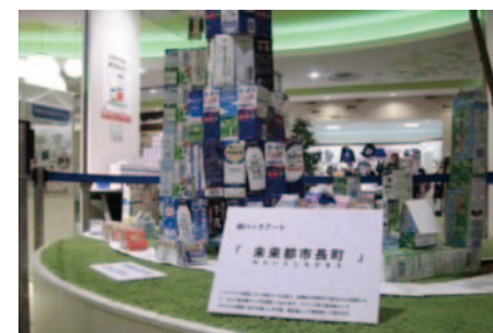
Paper carton art exhibition "Future city Nagamachi"

[Collaboration with mass merchandise store "LaLa garden Nagamachi"] On September 23 and 24, we held an "Experience learning of paper making" event as the first paper carton recycling campaign in the Tohoku area in the "LaLa Autumn Culture Fest" of LaLa garden Nagamachi in Sendai City. This event, which consisted of a discussion meeting on paper carton recycling, a paper carton art exhibition, and an eco recycling panel exhibition, was very boisterous with many parents and children attending.