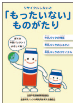
"Story of Waste"

"Real Story of Paper Carton Recycling" has been edited for children with intimate illustrations of the Milk Packn'.