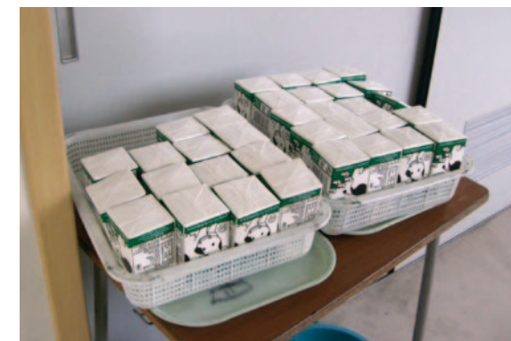
Rinse and dry milk cartons! (Toyama City Shinjo Primary School)