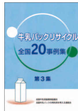
3rd edition "Nationwide Collection of 20 Cases"

COMCEI and JAMRA have started to collaborate with commercial facilities.