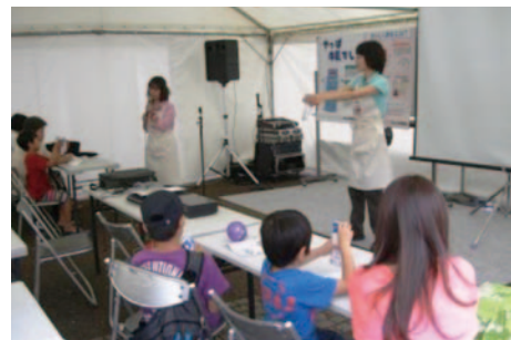
Disassembly of milk cartons by hand in the special tent

COMCEI booth was thriving every day. We participated in one of the largest environmental exhibitions in Japan.