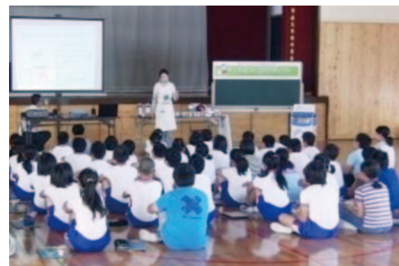
Children listening to "Story of recycling" (Motegi Cho Motegi Primary School)