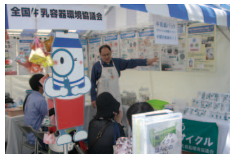
Our staff's explanation of exhibit panels on environment in the booth

With the help of the citizens group "Tanpopo", we demonstrated how postcards can be made from handmade paper and small items by using paper cartons in our exhibition booth. The demonstration was very popular and a long queue formed. We also held a workshop four times in a special large tent. About 40 visitors, after being served with milk, attempted to disassemble milk cartons by hand. Every person who successfully opened a milk carton received a box of tissue paper. Visitors learnt about recycling of milk cartons through the event.