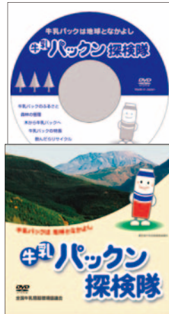
DVD "Milk Packn's Expedition"

COMCEI has prepared a detailed DVD version of the children-oriented website "Milk Packn's Expedition". This is an educational tool that helps them think about the environment and learn the importance of initiating their own activities. We will send it free of charge to schools and organizations that applied.