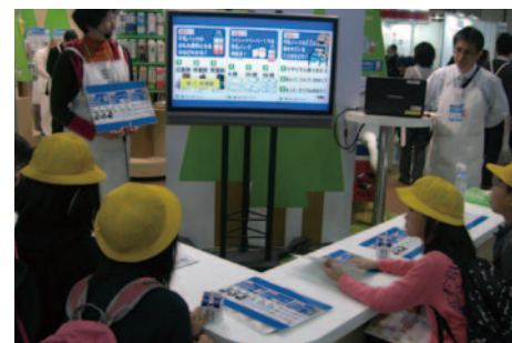
At the workshop

The total number of visitors was 169,076, which was slightly fewer than last year. Visitors to the COMCEI booth, however, increased to 1,722 from 1,502 the previous year. A range of events including a workshop titled, "Drink milk and open up empty carton with your hands", an annual event called "Postcard making from handmade papers" in cooperation with JAMRA, and exhibit panels on the environment and recycling issues that featured the "Story of Waste" were crowded every day with visitors.