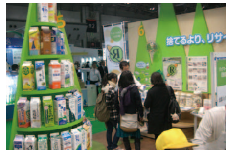
Educational exhibits on recycling