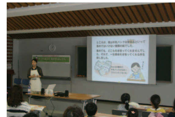
Lecture on Forestry Administration and Recycling (Nakano Ward)

A "Parent-Child Onsite Recycling" event was held at Recycle Square of Sagamihara City in two parts. One was a "Lecture on environment and experience learning of paper making" held jointly by COMCEI and JAMRA, and the other was "Onsite garbage collection" by the Environment and Economic Affairs Bureau of the city. After experiencing paper making, the participants rode on a garbage truck and saw how rubbish is discharged at the garbage collection plant.