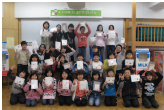
Completion of postcards made from handmade papers! (Yokohama City Hie Primary School)