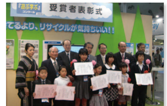
Awards ceremony held at Eco Products 2013