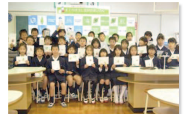
Hold your postcards and "Say cheese!" (Mitoyo City Matsusaki Primary School)