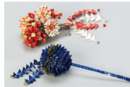
Best prize "Ornamental hairpin" Marina Hata

Approximately 2,856 primary school children participated in the 13th "Learn and Play" with Milk Cartons Contest 2013. Among the many impressive creations, the following seven prize-winning creations were selected through impartial examination. Congratulations!