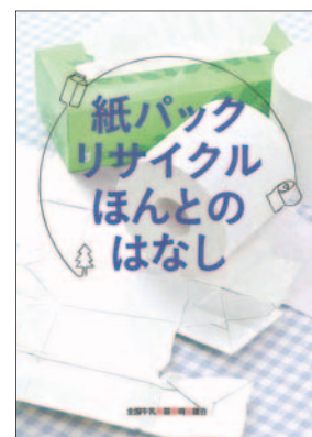
"Real Story of Paper Carton Recycling"

COMCEI published various publications to help people think of the global environment through recycling.