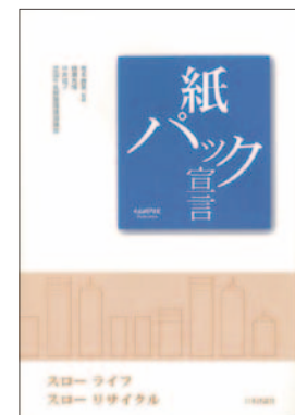
Book "Paper Carton Manifesto" Nippon Hyoron Sha Co., Ltd.

Currently, three methods have been established to collect paper cartons. These are: store collection, municipality collection, and voluntary group collection. To make strict separate collection a success, education of the local community and use of devices unique to individual communities are necessary. This case book introduces actual recycling activities carried out by citizen's groups, local governments and various business sectors throughout Japan to assist readers when they are confronted with problems.