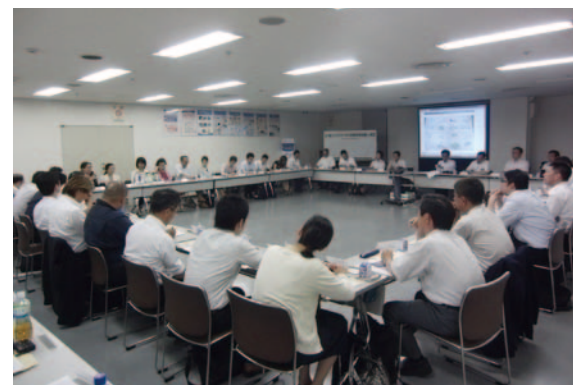
A scene of regional conference in Saitama

Through the regional conferences we have keenly felt the necessity to strictly observe the material separation rules, intensify educational activities, and rebuild the activity itself.